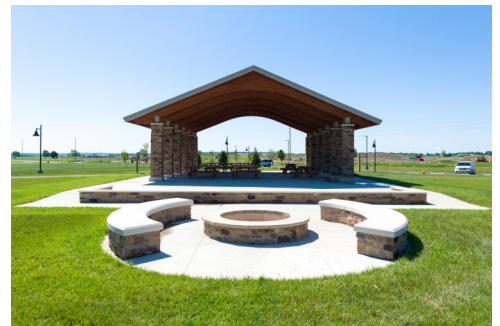
EAST PAVILION - FIREPIT