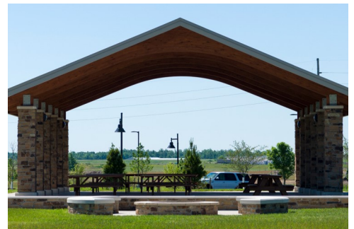
EAST PAVILION - SEATING AREA